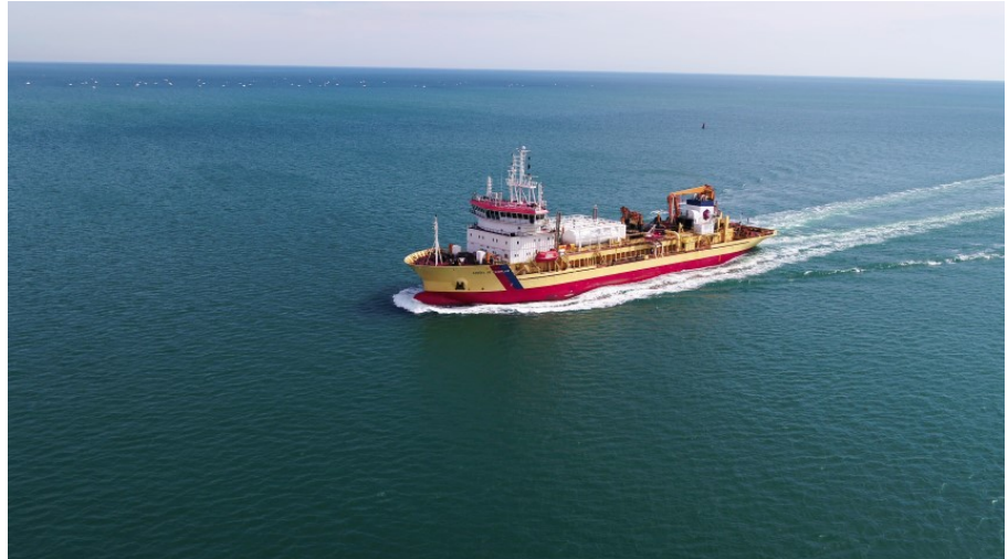
The 'Samuel de Champlain'